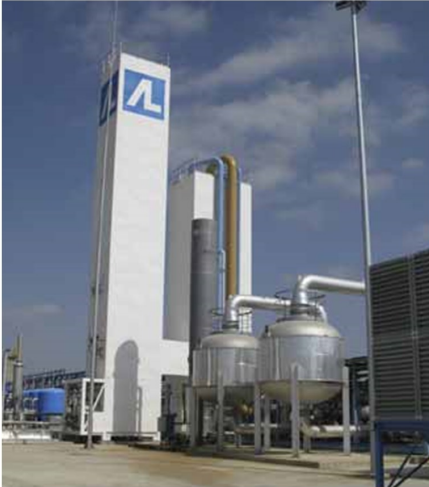
Figure 3. Air separation unit (courtesy of Air Liquide Global E&C Solutions).