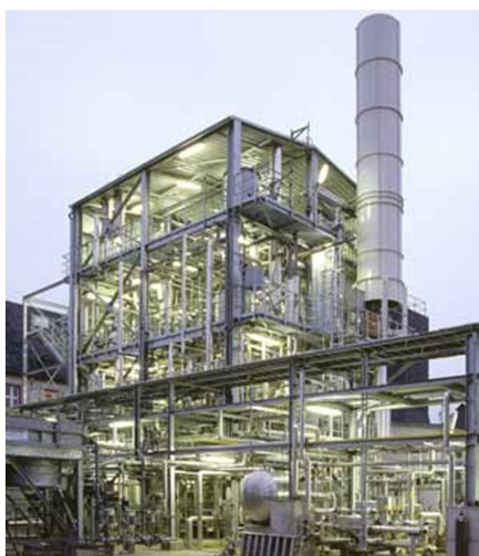
Figure 2. Lurgi GasPOX unit (courtesy of Air Liquide Global E&C Solutions).